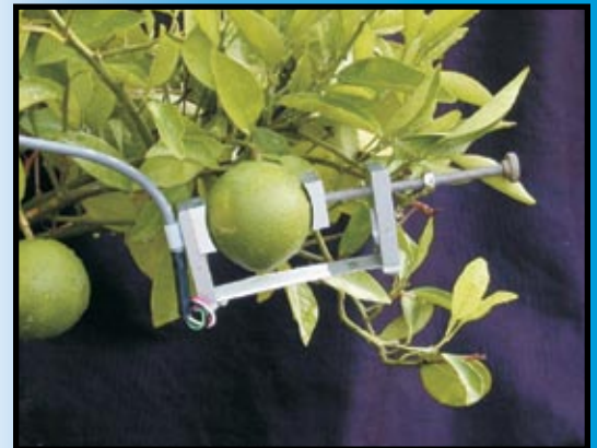
DEX20 Dendrometer measuring the growth of a navel orange.